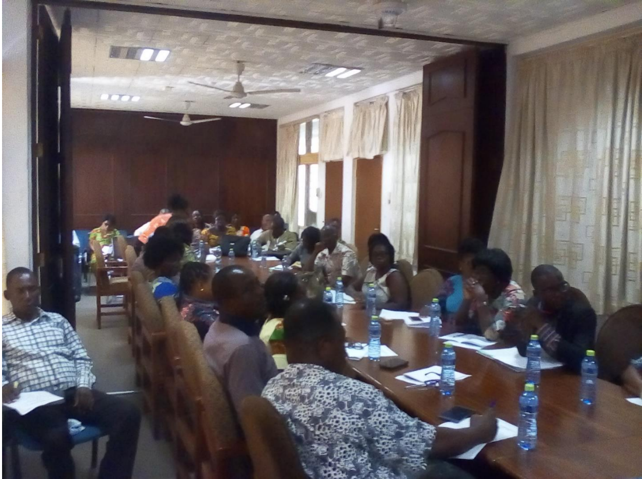
Figure 3: A cross section of participants at the KG Assessment Tools and Communication for Development (C4D) Strategy workshop in Accra.