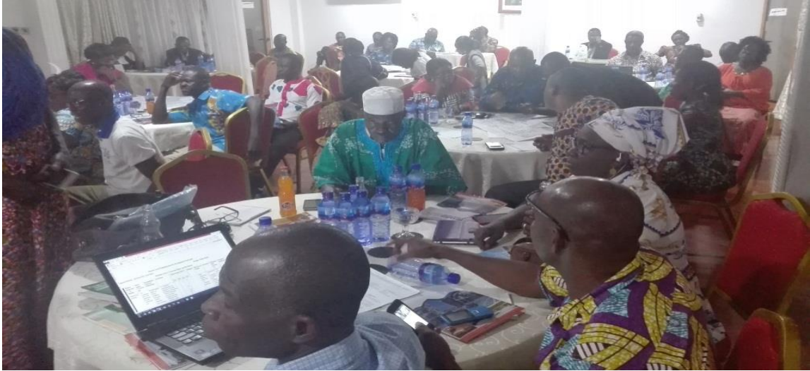
Figure 1: A cross section of participants at the C4D implementation workshop in Kumasi.